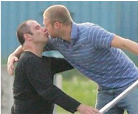
Surprise! 10 Celebs You Didn't Know Were Gay