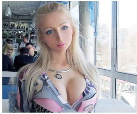
WTF: 21 Bizarre People You Will Refuse to Believe are Real