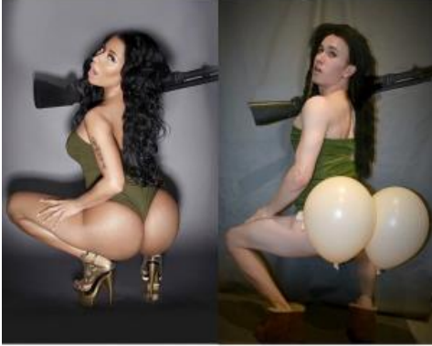
16 Celeb Photo Re-creations That Put the Original to Shame