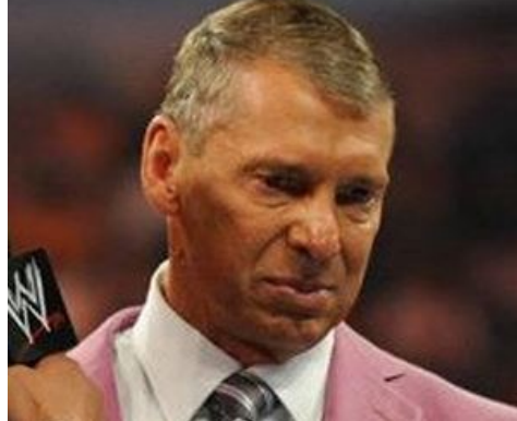
10 Ex-Billionaires Who Lost a Fortune