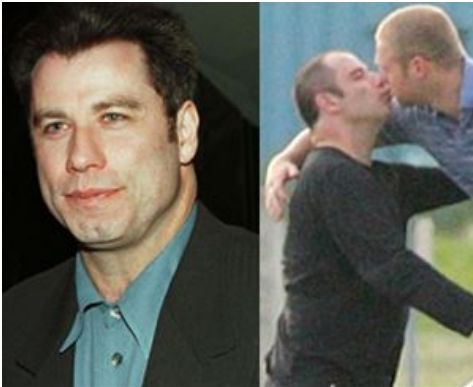
Surprise: 10 Celebrities You Didn't Know Were Gay