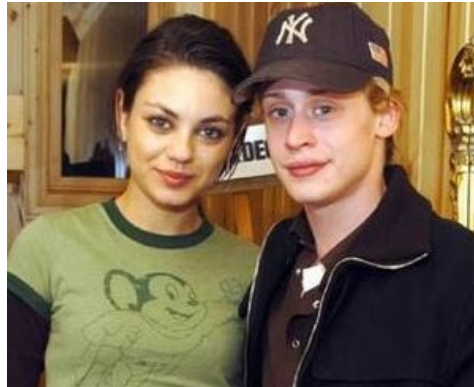
12 Weirdest Celebrity Couples of All Time