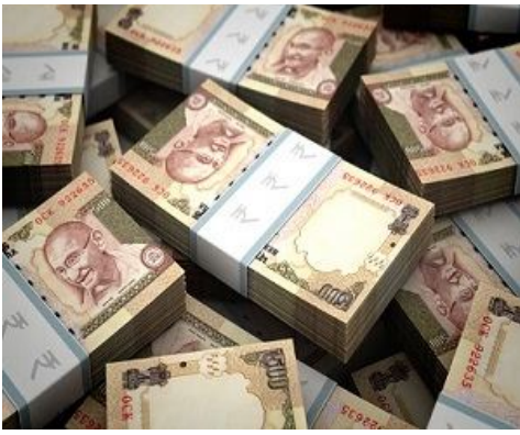
You Can Earn Rs. 6,302/Day Online