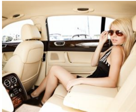
Millionaires Want This Video Banned. Watch Now